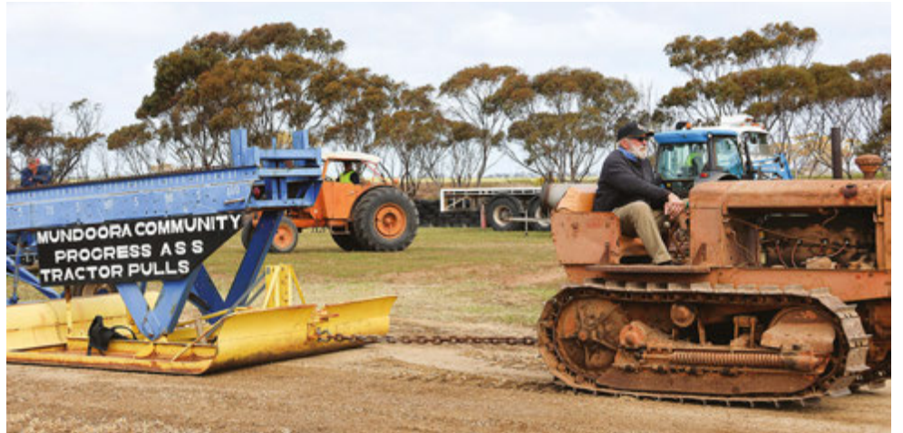
Mundoora Community Progress Association again loaned its tractor pull sled for the field days event.