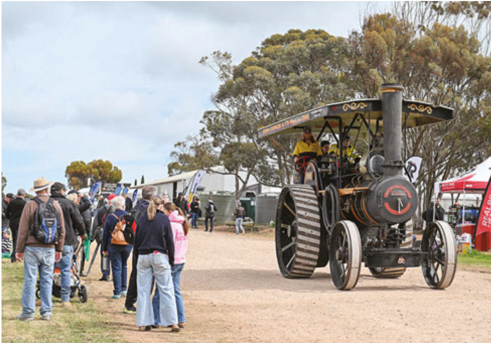
The steam engine, owned by Simon Huntington of Mount Compass, made an impressive sight lumbering around the field days site.