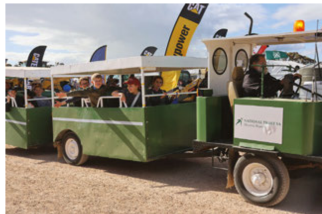
People made use of the shuttle tram to make their way around the field days site, thanks to the National Trust SA Moonta branch.