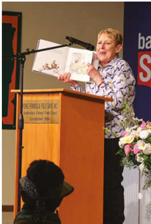
Mem Fox hosted two live readings of her children's books on day one, September 30, which saw the Guest Speaker Centre fill up with families.