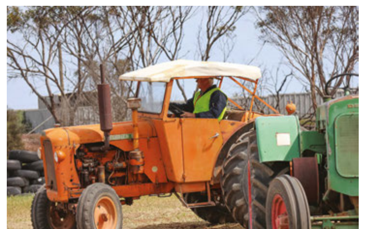
A Champion tractor about to be put through its paces at the tractor pull.