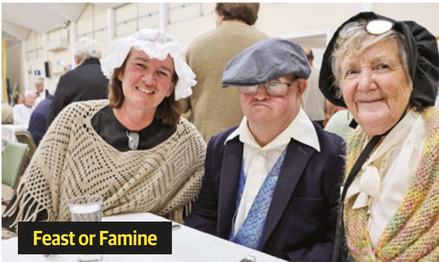
Feast or Famine