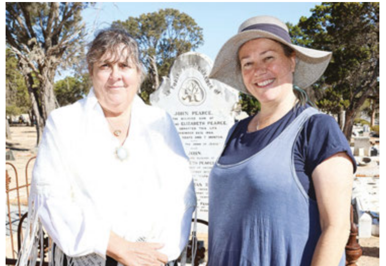
Moonta cemetery walk