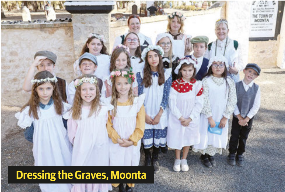
Dressing the Graves, Moonta