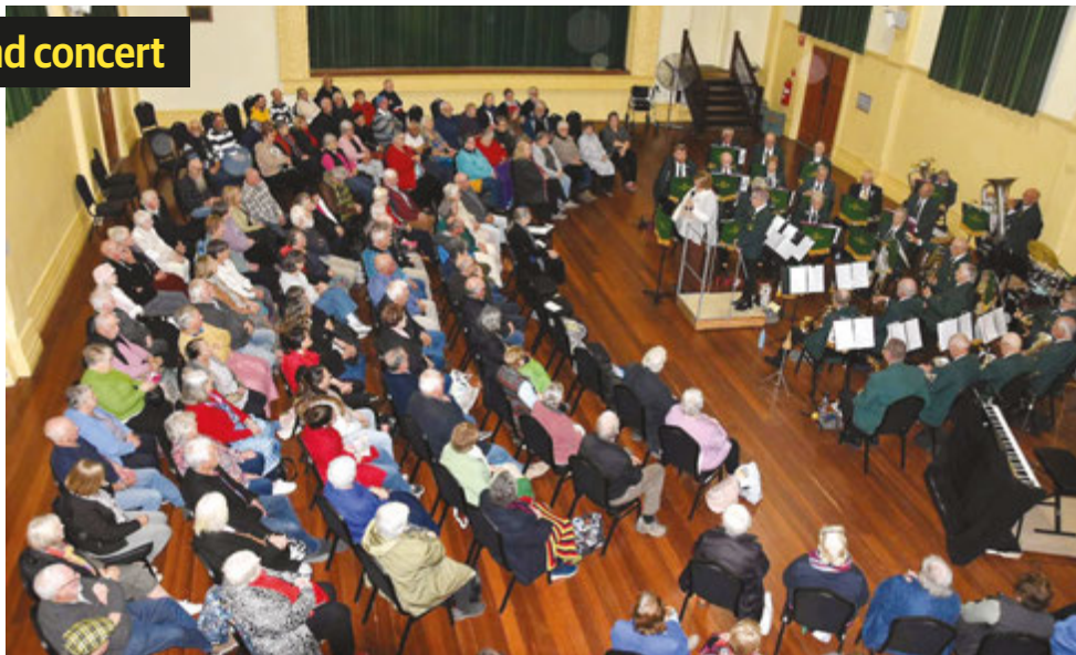
KWM BAND... The Kadina Wallaroo Moonta Band, now in its 162nd year, performed for 200 people at Wallaroo Town Hall as part of Kernewek Lowender.