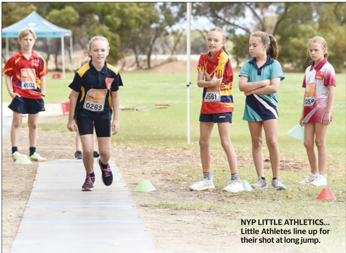
NYP LITTLE ATHLETICS... Little Athletes line up for their shot at long jump.

Northern Yorke Peninsula Little Athletics