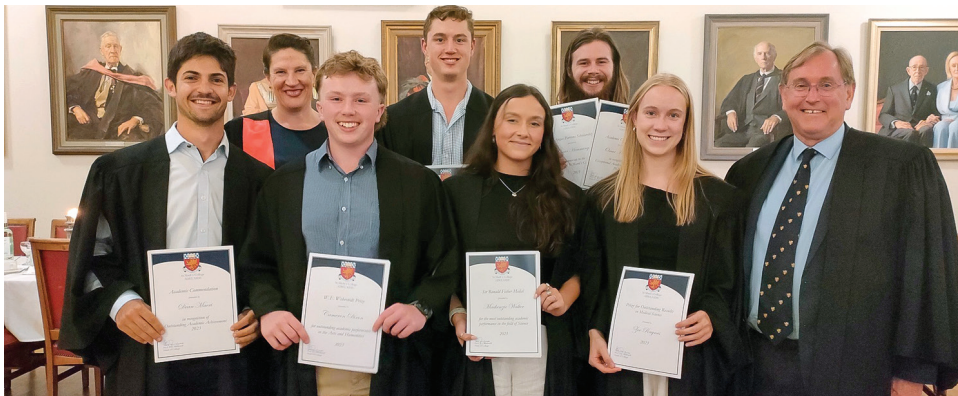
NEXT GENERATION... St Mark's fosters the development of community-minded young people, with ample service opportunities for students