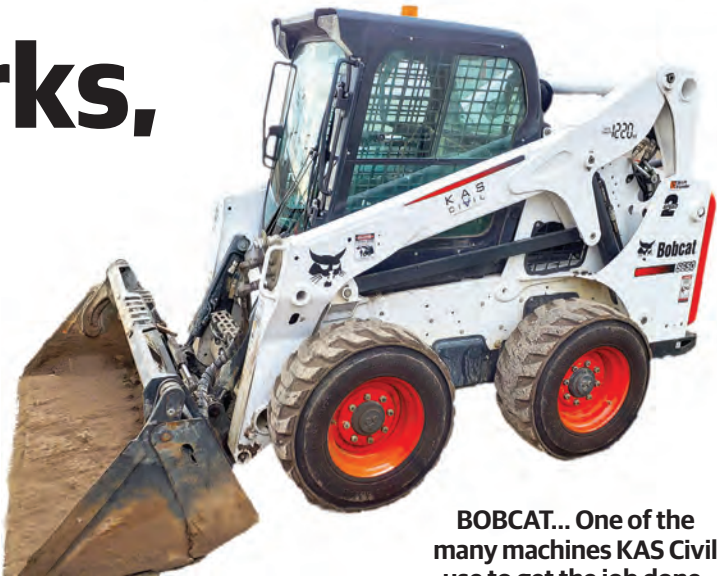
BOBCAT... One of the many machines KAS Civil use to get the job done. Below: TIPPER... One of KAS Civil's trucks moving a tipper from one site to another to complete a job.

equipment and machinery to do it for you, if you do not want to or cannot do it yourself. "The sand and metal offerings will be the usual offerings: road base, gravels, concrete aggregates, as well as mulch, landscaping bark and more," Simon says. "We will also provide bagged products such as cement, concrete, paving sand and bagged mulch and garden soil improver." Licensed to supply potable water, KAS already delivers water to dozens of customers and can now supply and install the tanks to store it. KAS Sand & Metal will also offer retaining wall products such as sleepers, iron and associated products, as well as OX tools – a high-quality tool manufacturer of everything from tape measures, line marking equipment, string lines, shovels, concrete trowels, cutting discs, hammers and more. "These are all things you'd expect to need if you are DIY landscaping," Simon says. "However, we are not and do not pretend to be a general hardware store." While not fully operational yet, the sand and metal yard is partially open for delivery and pre-arranged pickups. With years of expertise and experience, KAS can recommend, advise and deliver almost any quantity, anywhere and, if it all gets too much, they can build what you need as well! For more information, head to www.kascivil.com.au/ .